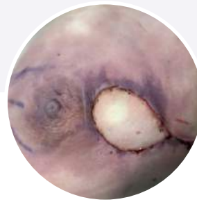
Figure 3. Postoperative nipple and skin sparing mastectomy, with skin island.