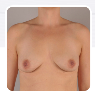
Figure 1. Preoperative clinical image.

The female patient is a 45yr old BRCA2 gene carrier with a family history of breast cancer (Figure 1). During follow-up, she presented with a suspicious lesion (<1 cm) in the left breast and a core needle biopsy confirmed ductal breast cancer. Due to her increased breast cancer risk, a bilateral nipple-sparing mastectomy and reconstruction with a bilateral DIEP flap was planned.