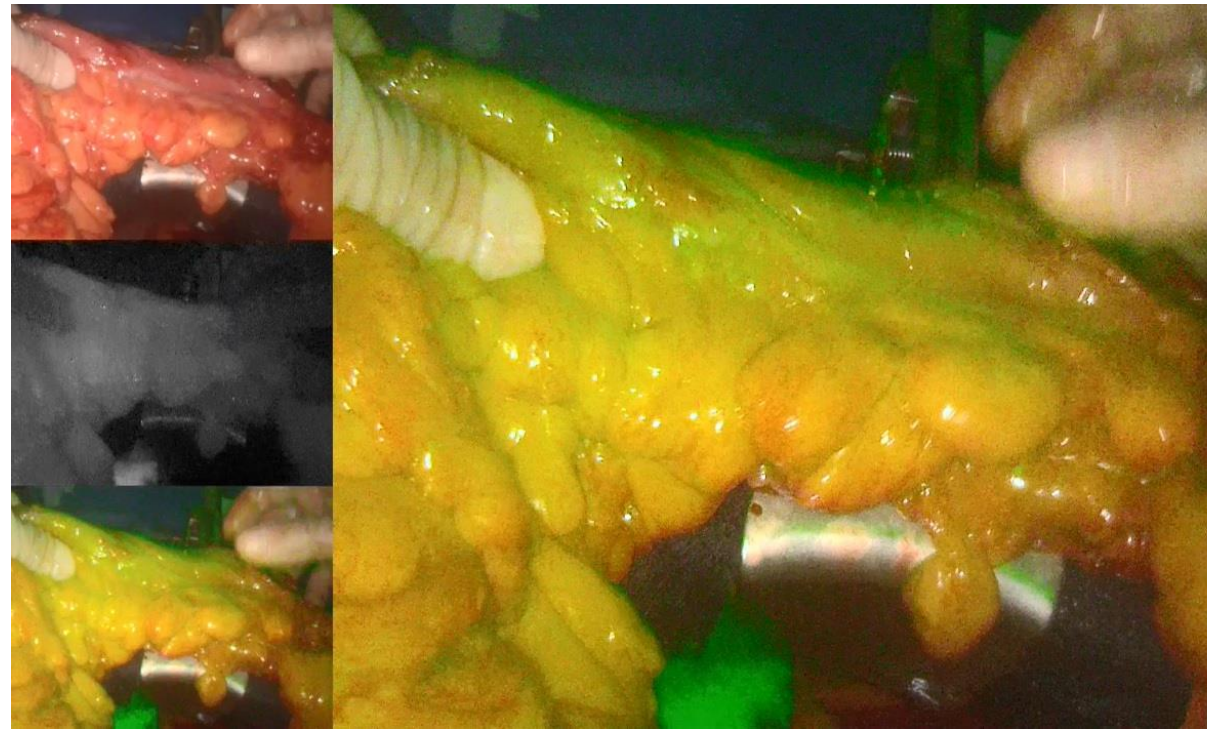
Figure 2. Colonic perfusion and ICG