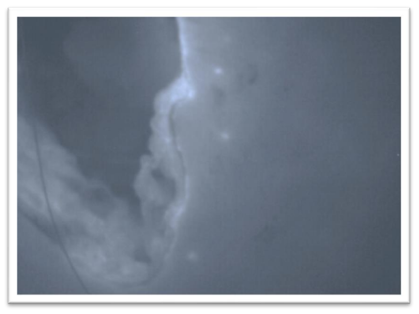
Fig 2. Abdominal wall skin evaluated with Indocyanine Green (ICG) demonstrating good vascular perfusion at the wound edges.