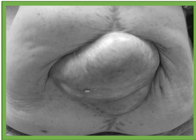
Fig 1. Large incisional hernia with secondary intention healing and skin graft of the middle portion.

After a 3.5 mL intravenous injection of Indocyanine Green (ICG), the abdominal wall skin was then evaluated with the IC-Flow™ Imaging System (Diagnostic Green GmbH Aschheim-Dornach Germany) infrared camera ( Fig. 2 and 3 ). Based on this evaluation, the non-perfused skin was debrided and excised (approximately 80 cm 2 ). Following the insertion of two closed drains, the skin was closed over. The skin was then closed over two closed suction drains. The patient tolerated the surgery well, and he was discharged without complications on post-operative day three. There were no postoperative complications and no hernia recurrence at his 12 months follow up.